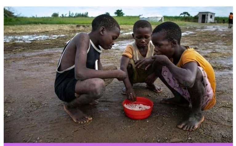
"A change of attitude towards migrants and refugees is needed on the part of everyone. Let's move away from defensiveness, fearfulness, indifference and marginalization towards a healthy attitude underlying the culture of encounter." Pope Francis